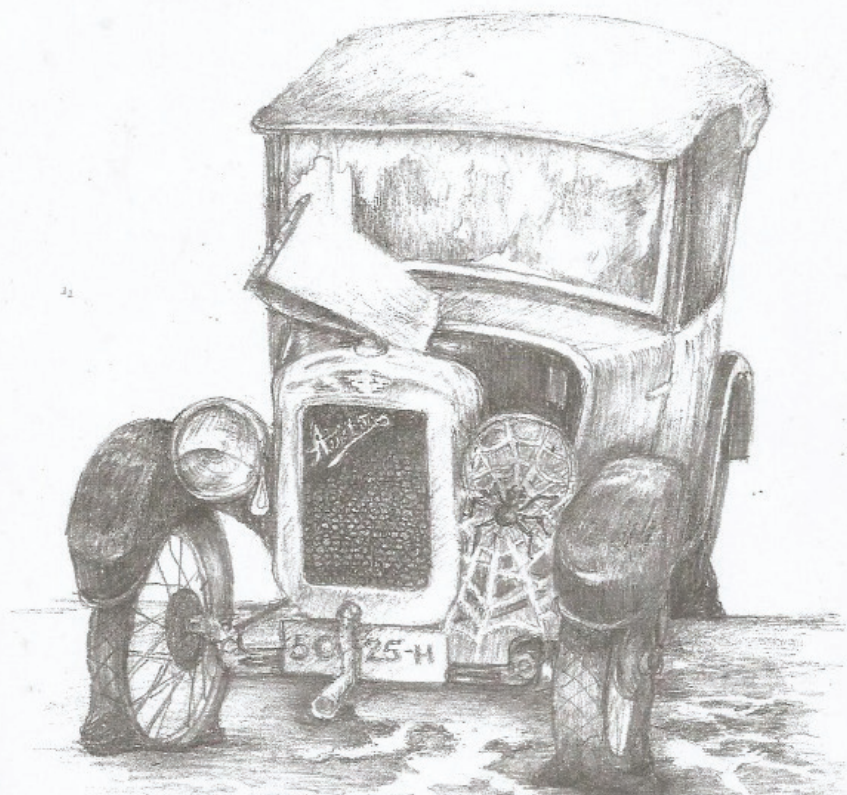
Drawing of Phryne by Kath Cole