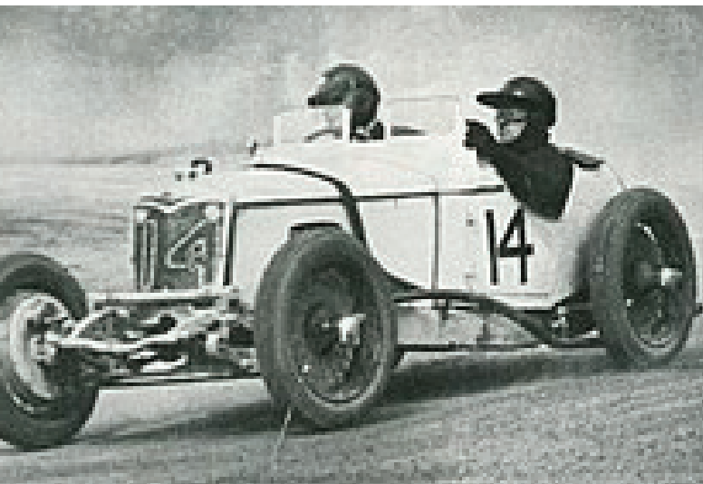
Race winner Bill Thompson (Bugatti Type 37A) contesting the 1932 Australian Grand Prix