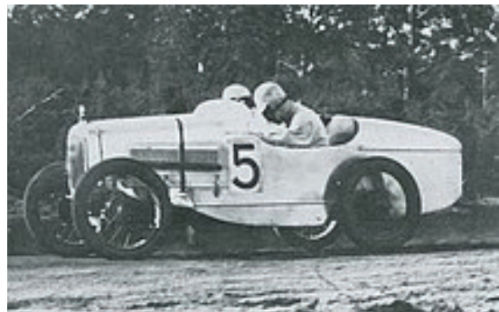
Cyril Dickason placed third driving an Austin 7 Ulster