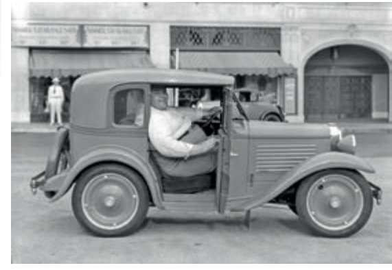
WHY THE BANTAM (AUSTIN 7) WAS NOT POPULAR IN USA.