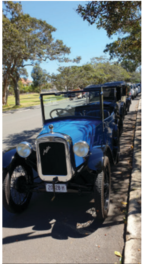
No one wants to scratch their tyres on the curb