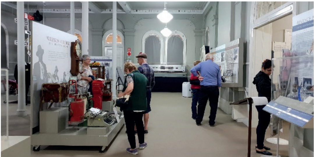
Werris Creek Station museum