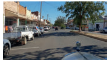
A small town located 45km northwest of Tamworth