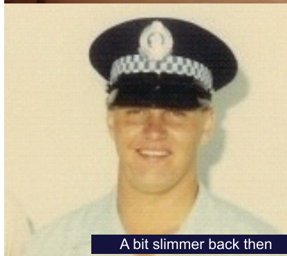
A bit slimmer back then