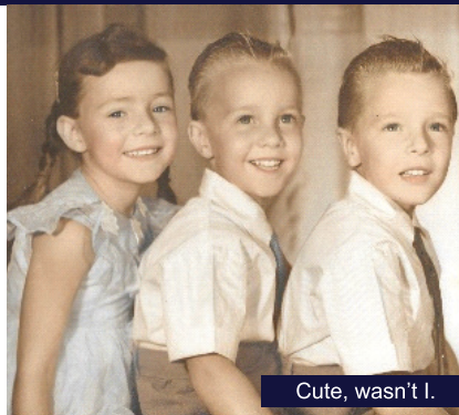
Cute, wasn't I.

I remember dad coming home one day about 50 years ago and reversed a ute up to a shed in the backyard. I helped him unload a pile of what I thought was old rusted body panels