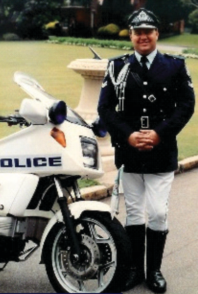
Who's a pretty boy!